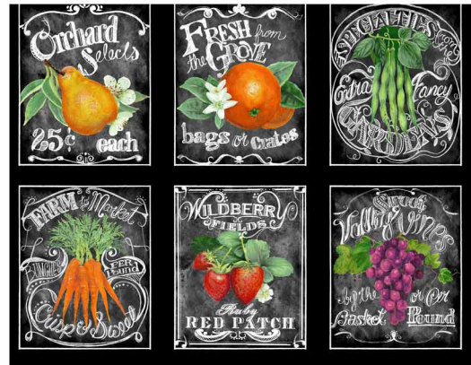
B - 41352-X Multi