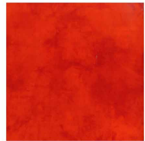
A - 37098-16 Cherry